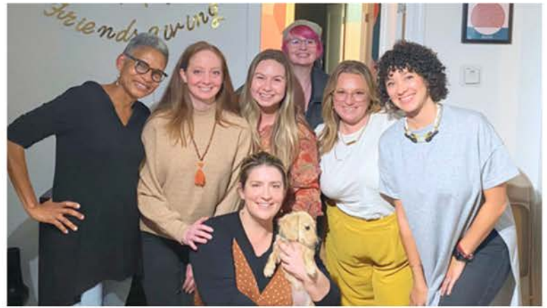
Members at one of our Friendsgiving Area Meeting