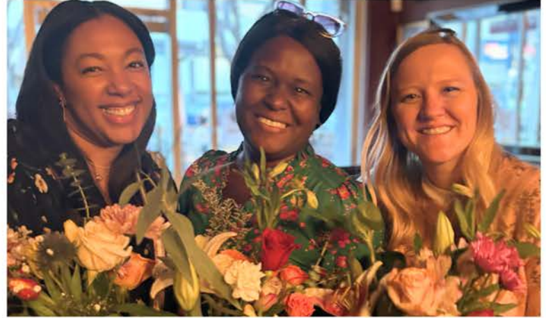
Members at our Galentine's Day Event