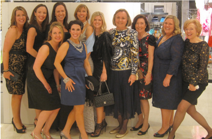
Eleven past, present and future JLOEB Presidents enjoy the Neiman Marcus festivities.