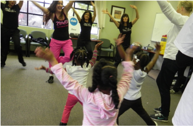
Shakin' it...Zumba style!